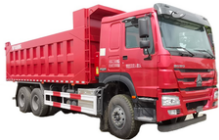
Dump Truck 30 Ton

BBSP has been supported by a reliable fleet from the best brands also a team of qualified and experienced mechanics to executes repair and maintain the finest fleet condition through scheduled regular maintenances.