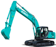
Hydraulic Excavator 20 Ton