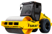
Vibro Roller & Sheep's foot