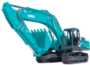
Hydraulic Excavator 30 Ton